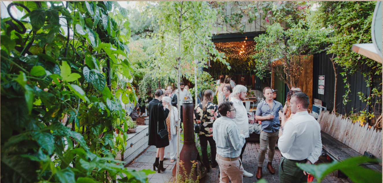
Shady and cool in summer, warm and cosy in winter