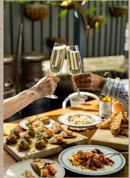
Networking, celebrations and birthdays at Peter Rabbit